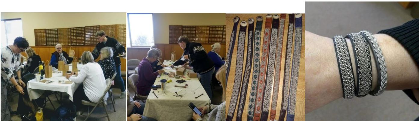
Sami Bracelet Class